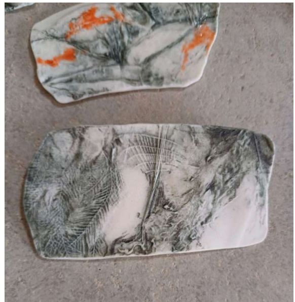
These porcelain hand painted pendants are all limited editions and one of a kind and will be available in the web shop soon.