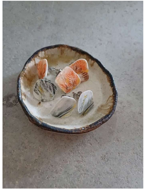
Collection of stud earrings all with stainless steel posts and backings

The ocean range of pendants features impressions of rocks, Tasmanian seaweeds, grasses and shells all found locally.