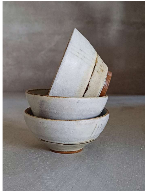
a s h bowl - wheel thrown, layered oxide and ash glaze on an iron rich red clay.