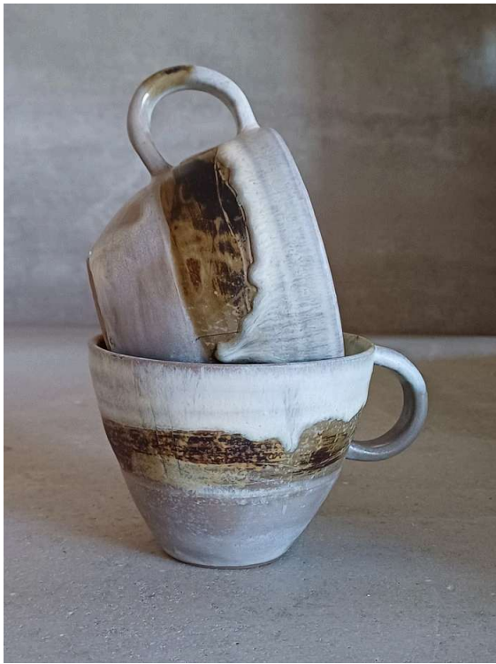
a s h cup - wheel thrown with a handle, layered oxide and ash glaze on a smooth grey clay.